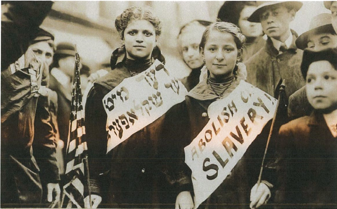
Public Domain. Library of Congress, LC-DIG-ppmsca-06591.

Polish immigrants in 1908 with signs demanding an end to unfair child labor practices that affected Poles and other groups of immigrants in the United States.